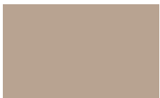
Beige WB 49