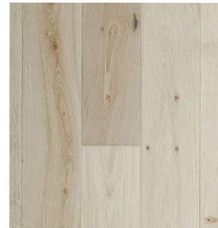
Ivy Point BH537OIP