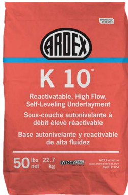
K 10 K 10 50