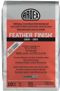
Feather Finish (Gray) FF10G