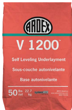
V 1200 V1200 50