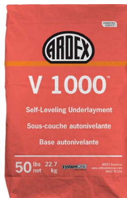
V 1000 V1000 50