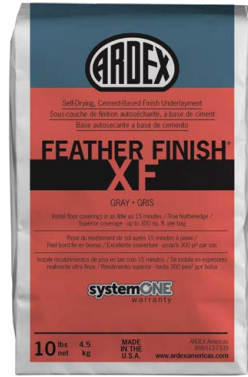
Feather Finish XF (Gray) FFXF10G