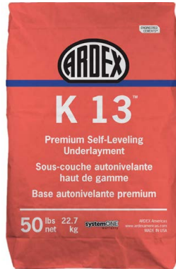
K 13 K 13 50