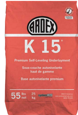
K 15 K 15 55